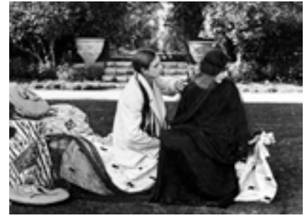
Jaque Catelain and Claude-France Aïssé in Rose-France, Marcel L'Herbier, 1918.

I can say that all around me at the time, I encountered a deep-seated lack of regard for filmmakers. Everyone in the world in which I moved – the bourgeoisie – said cinema was an art of the fairground. It's fine for circuses but not anywhere else; it's worthless, just entertainment. There's Max Linder or Chaplin but nothing in cinema constitutes even an embryo of an art form. [This was true] to such an extent that, in a family like mine, to be a filmmaker was considered a disreputable profession. I don't mean that I was disowned by my family - but almost.