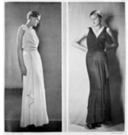
Chanel evening dresses, Femina , November 1932.

You have to create a special fashion for film, or at least interpret current fashion without losing the plot. This way you avoid two snags: creating 'costume', which would be too easy, or seeing clothes go rapidly out of fashion. American film stars seem to feel they lack guidance. The fabulous sums they spend and the complete freedom they are allowed have led to a kind of clothing anarchy or fatigue, which they would like to leave behind. I work hard to try to create a film style. On the other hand, fashion can be promoted by the cinema nowadays. Up to now, film has been content to follow fashion – not the fault of the actors but the directors; they've paid too little attention to the question of costume or else used second or third rate fashion houses.