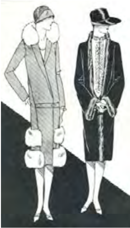
Drecol, Chiffons , 20 June 1926.