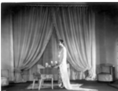
Marie Glory in L'Argent, Marcel L'Herbier, 1928. Costume by Jacques Manuel.