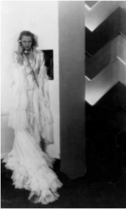
Brigitte Helm in L'Argent , Marcel L'Herbier, 1928. Costume by Jacques Manuel. Chevron light panel designed by Jaque Catelain. © Marie-Ange L'Herbier, courtesy Bibliothèque du Film (BIFI), Paris.