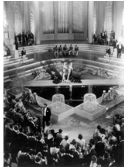
L'Argent, Marcel L'Herbier, 1928. Set design by Lazare Meerson and André Barsacq.

L'Argent ... is unquestionably [L'Herbier's] greatest film, I think it's even one of the two, three or four silent films pieces of work which even today can still completely engage our sensibility. It's not as perfect as Pandora's Box by Pabst for example, which for me is the greatest film of the silent era, but it's comparable. And to me, it goes along with, I'd say, Fritz Lang's Mabuse films, Gance's La Roue - those are the few films which today, due to their complexity, the contradictions they examine and so on, remain current. For a long time, I thought it was exclusively down to their technical innovations. It's certainly not the first film to use camera movement that way but it's definitively one of the silent films, if not the first silent film to use them with such zest, such enthusiasm and even ostentation.