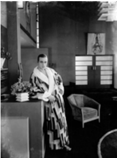
Jaque Catelain in a publicity photograph for Le Vertige , Marcel L’Herbier, 1926, showing Catelain posing in a dressing gown made from simultaneous fabric by Sonia Delaunay. Robert Delaunay’s painting of the Eiffel Tower hangs on the wall above the double door, chair by Pierre Chareau.

The film’s allusive English title The Living Image (it was also released in the U.S. in 1928 under the more functional title of The Lady of Petrograd ) foregrounds L’Herbier’s articulation of style and decoration in conjunction with fantasy and desire. The title also refers to Catelain’s dual role as the reincarnation of Natacha’s former lover, whose uncanny return to haunt her is set in the glamorous city of Nice. Le Vertige documents the emergence of the French Riviera in the early