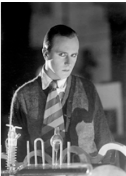
Jaque Catelain in L'Inhumaine , Marcel L'Herbier, 1924.

To look at L'Herbier's work through the prism of art and design is to draw attention to the filmmaker's status not only as a significant figure of French cinema but also as a hitherto unrecognised force in French modernism. Motivated above all by his pursuit of 'photogenic' and 'total' cinema, 2 L'Herbier assembled a truly