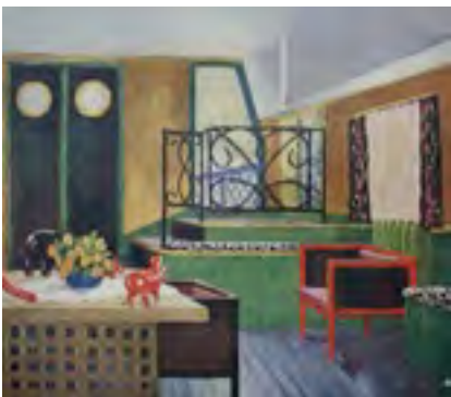
Atelier Martine interior display in the Paris 1925 Exposition internationale des arts décoratifs, showing furniture similar to that used in Le Vertige . From Léon Deshairs, Intérieurs en couleurs France, 1925.

architect Robert Mallet-Stevens, whose contributions to Le Vertige gave it its distinctive aesthetic.