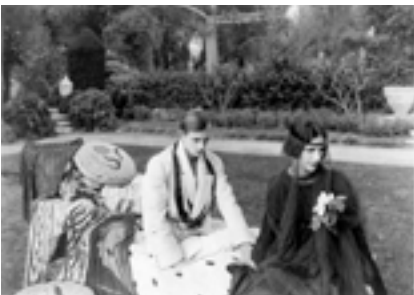
Jaque Catelain and Claude-France Aïssé in Rose-France, Marcel L'Herbier, 1918.

The costumes in Rose-France were carefully chosen in black, white and shades of grey not only for their strong aesthetic, but also to forward the plot. Catelain plays a decadent dandy who first appears in a white suit with a black and white scarf. Later, when he suspects his fiancée may be in love with someone else, his clothes become black, with white trimmings. A similar change occurs in the costumes of the leading lady, played by Mlle Aïssé, who is at first clad entirely in black, to symbolise her distress at the war. When she feels hopeful again about a possible victory, her long, Pre-Raphaelite style dress and veil transform through a double exposure and become white.