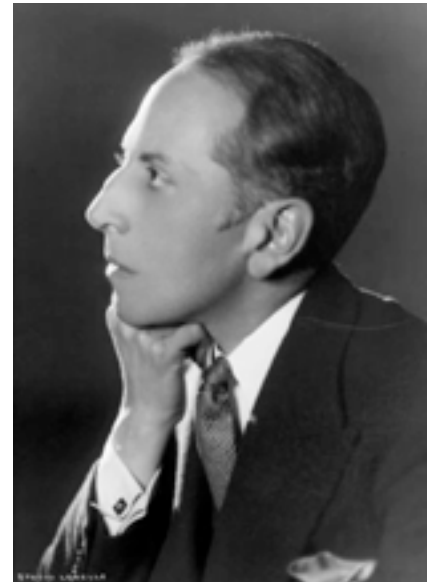
Marcel L'Herbier, studio portrait.