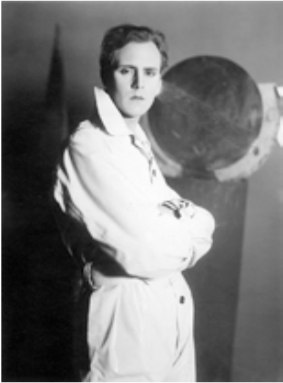
Jaque Catelain in L'Inhumaine , Marcel L'Herbier, 1924.

a rejection of the prevailing 'cult of strength'. For Véray the film is a studied rumination on the meaning of manliness and its co-option by the destructive forces of war. 13 In this instance, then, it is possible that – if only in L'Herbier's imagination – the ephobic male can channel a subversive cultural critique of conventional war narratives.