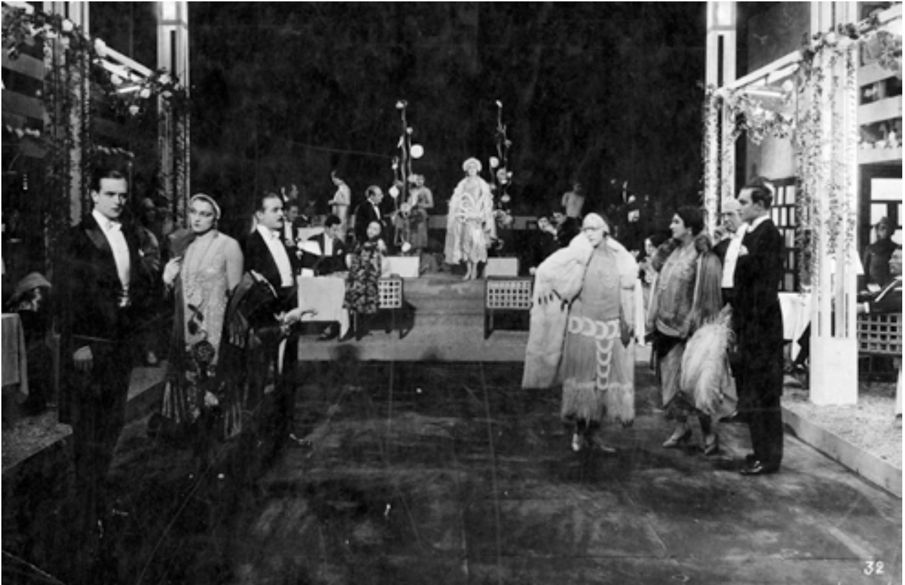
A set from Le Vertige, Marcel L'Herbier, 1926. Decor featuring chairs by Paul Poiret's workshop Martine.