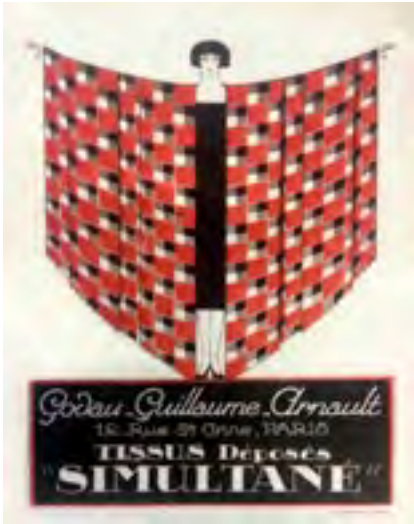
Advertisement for 'Simultaneous' fabrics. L'Officiel de la couture , 1924.

Le P'tit Parigot (both 1926). 4 Although these black and white films could not reproduce the vibrant colour contrasts of simultaneous art, the Delaunays' work was clearly considered important in conveying a kind of deco 'moderne'. Simultaneity enhanced the filmic narrative's depiction of an affluent, modern milieu, social encounters revolving around sporting activities, motoring, parties and dancing.