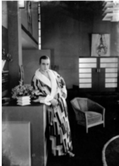
Jaque Catelain posing in a Sonia Delaunay dressing gown for Le Vertige , Marcel L'Herbier, 1926.