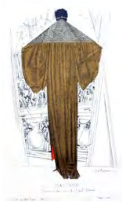
Paul Poiret evening coat, Gazette du Bon Ton, no2, March 1920.