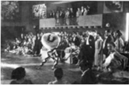
Dancer Lizica Codreano performing in Le P'tit Parigot , René Le Somptier, 1926.